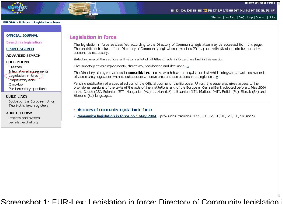
Screenshot 1: EUR-Lex: Legislation in force: Directory of Community legislation in force: <u>http://eur-lex.europa.eu/en/legis/index.htm</u>

The 'Directory of Community legislation in force' is available in EUR-Lex via the collection 'Legislation in force' from the menu on the left side of the screen.